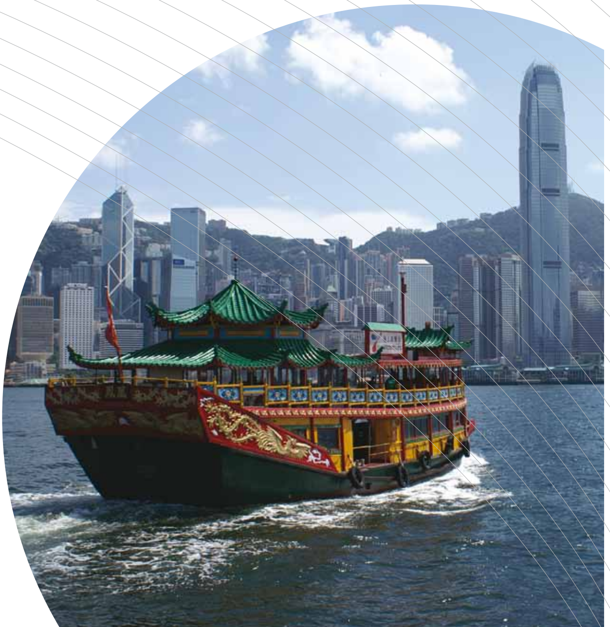
Hong Kong 17:00

We operate in markets that are fast-growing and made up of both expatriate and local customers.